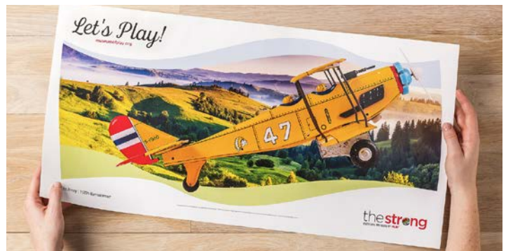
Extra-long sheet printing—maximum paper size 13 x 26" (330 x 660 mm)

It all adds up to better margins, higher profits and the ability to grow strategically with a single, future-proof investment.